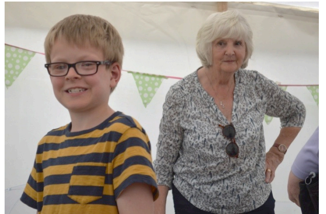
Guardians of Ancora Activity Day.

One man said “for free?” and the response came “aye we’re the Kirk so we’re fiel like that! There’s a donation basket if ye must.”